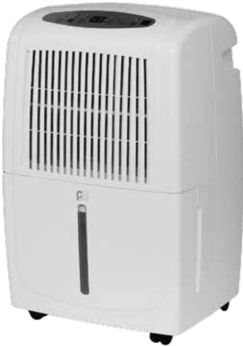
BUCKET W/ HANDLE